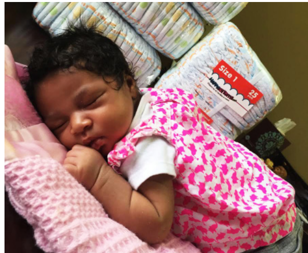
Baby Alice is just one of the thousands of babies HappyBottoms served in 2015

This report reflects donations received between January 1 and December 31, 2015.